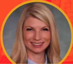
Sen. Brittany Petersen

LIMITING TRANSCRIPT WITHHOLDING TO HELP STUDENTS THRIVE