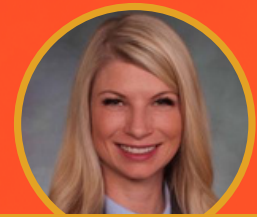
Sen. Brittany Petersen