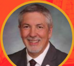
Sen. Dennis Hisey

GIVING 1.3 MILLION COLORADANS A CLEAN SLATE