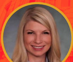
Sen. Brittany Petersen