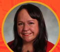
Sen. Faith Winter