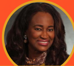
Rep. Naquetta Ricks