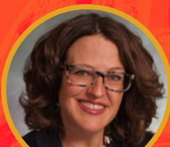
Rep. Daneya Esgar

PROTECTING COLORADANS FROM SURPRISE BILLING