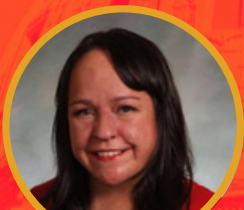
Sen. Faith Winter

MAKING HEALTHCARE MORE AFFORDABLE AND DEPENDABLE