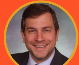
Sen. Jeff Bridges