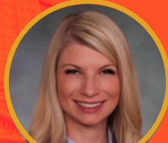
Sen. Brittany Petersen